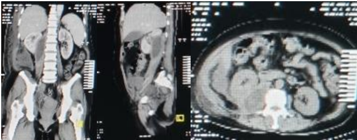
Figure 2: Abdominal Contrast CT Scan with anterior, lateral, and sagittal section showing an abscess with a well-defined hypodense lesion on the psoas major muscle