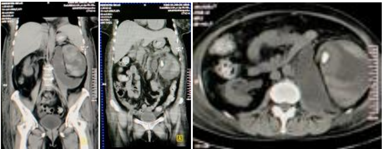
Figure 3: Abdominal Contrast CT Scan with anterior, lateral, and sagittal section showing hypodense lesion in the left perirenal area and a well-defined hyperdense lesion in the left proximal ureter measuring 12x6 mm

A 52-year-old woman came with complaints of pain and fullness in the left flank three days ago. Previously, the patient complained of a high fever for seven days accompanied by low back pain. The patient underwent gallstone surgery one month ago. The patient has had a history of controlled diabetes since eight years ago, and there is no history of hypertension and tuberculosis. A CT scan with contrast found that there was a hypodense lesion in the left perirenal area and a well-defined hyperdense lesion in the left proximal ureter measuring 12x6 mm. In intraoperative findings, 200 cc of pus was found in the perirenal area and a left proximal ureteral stone measuring 12x6 mm. During his treatment, the patient died of suspected hospital-acquired pneumonia (HAP) during postoperative care.