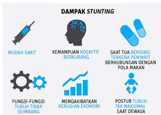
Figure 2 Impacts of Stunting

From the above Figure 1.2, it is explained that the long-term and medium-term impacts of stunting include the following: